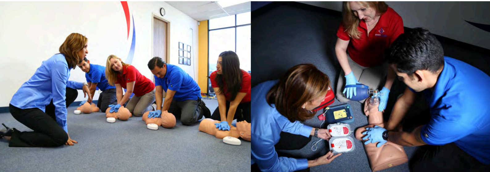
Instructor Led, Students in Conference Room with students