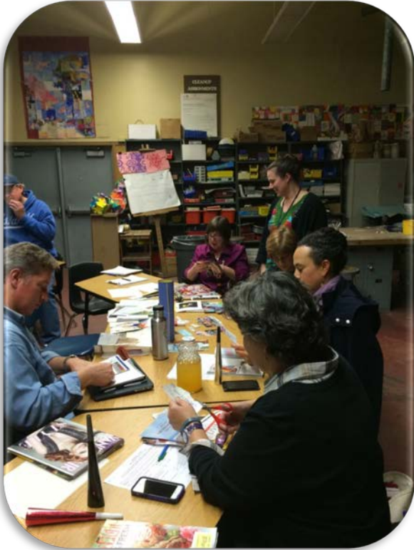
6 th Grade Team Creating